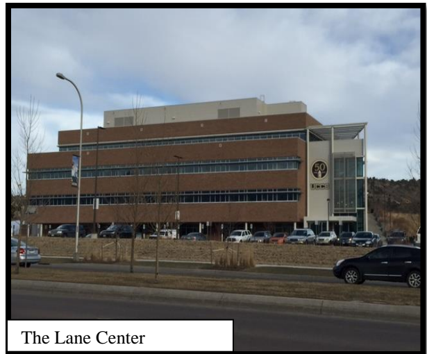
The Lane Center

Construction is continuing on The Visual and Performing Arts Building to be located on the former 4 Diamond Sports Complex.