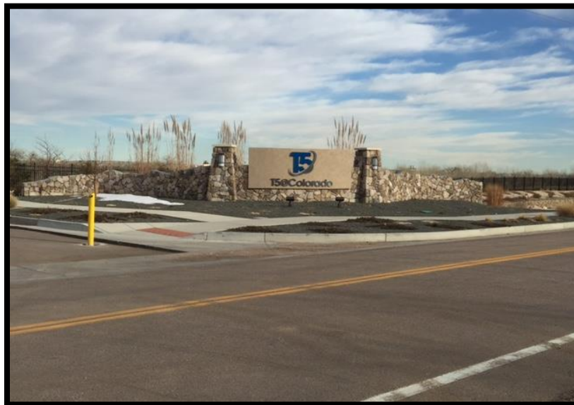
West Side Entrance

Location: The boundaries of the Area include approximately 109 acres of land generally defined to include 4 legal parcels plus public rights-of-way. Geographically, it is situated in southern Colorado