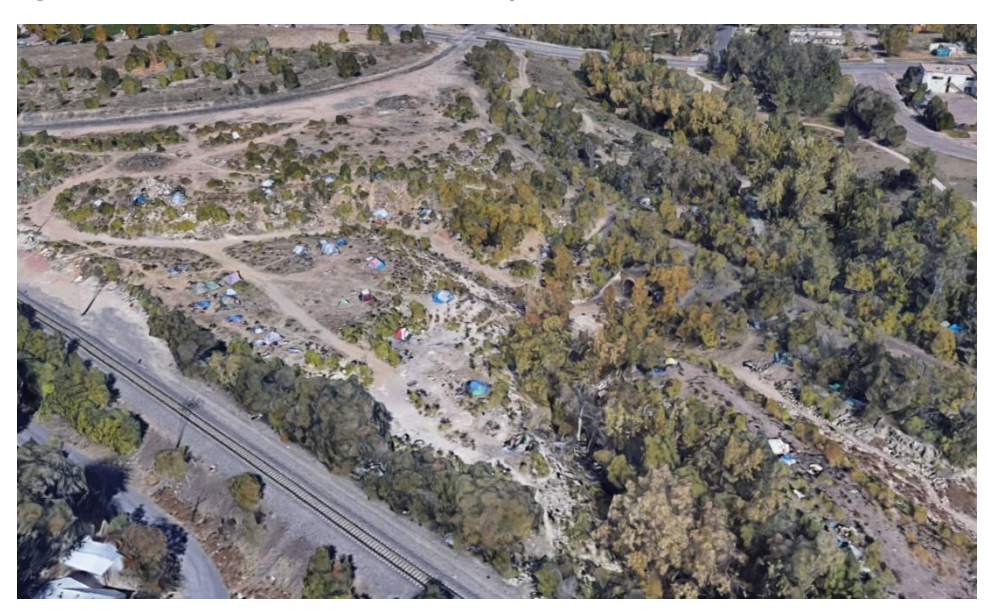
Figure 7. Evidence of Homeless Encampment