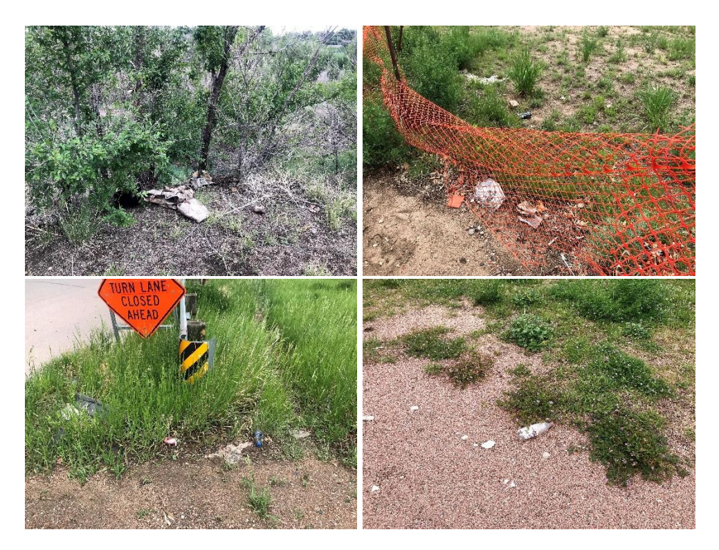
Figure 6. Evidence of Vagrants