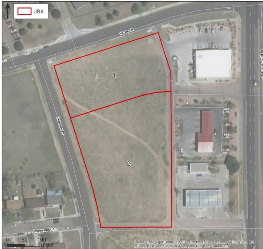
Figure 1. Almagre Urban Renewal Plan Area