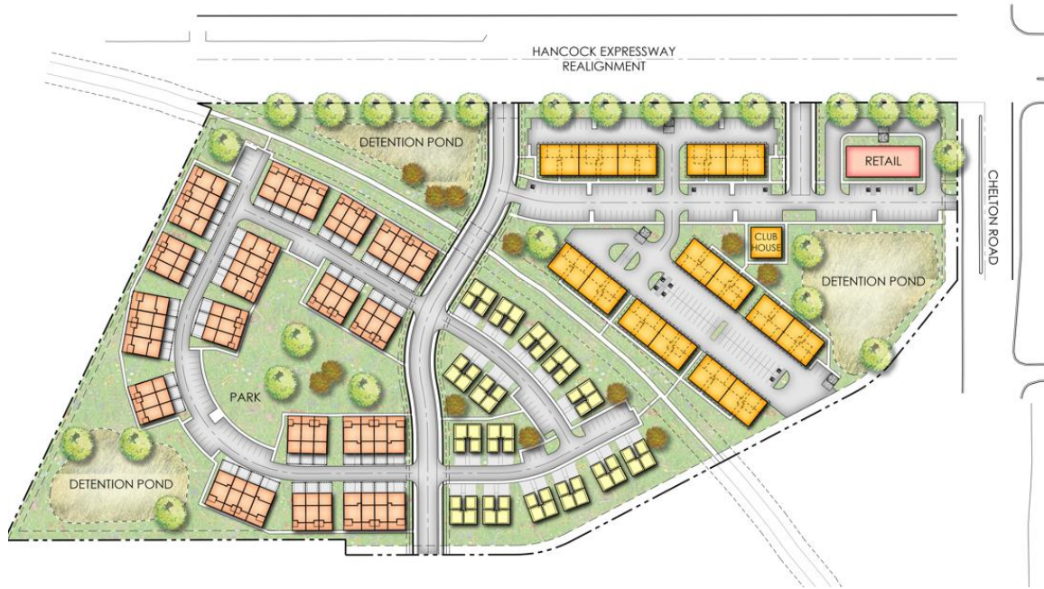
Figure 2. Hancock Commons Site Plan