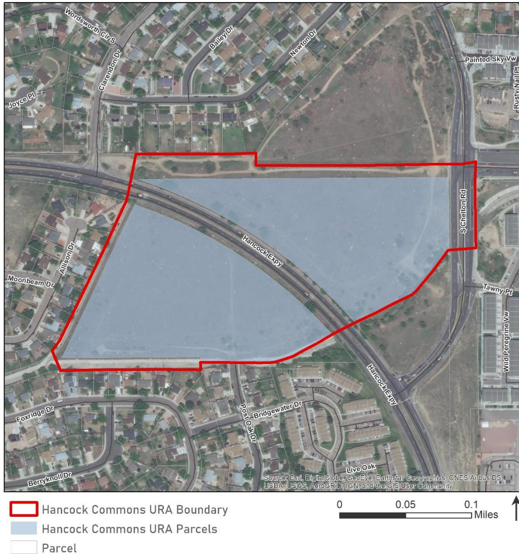
Figure 1. Hancock Commons Urban Renewal Plan Area