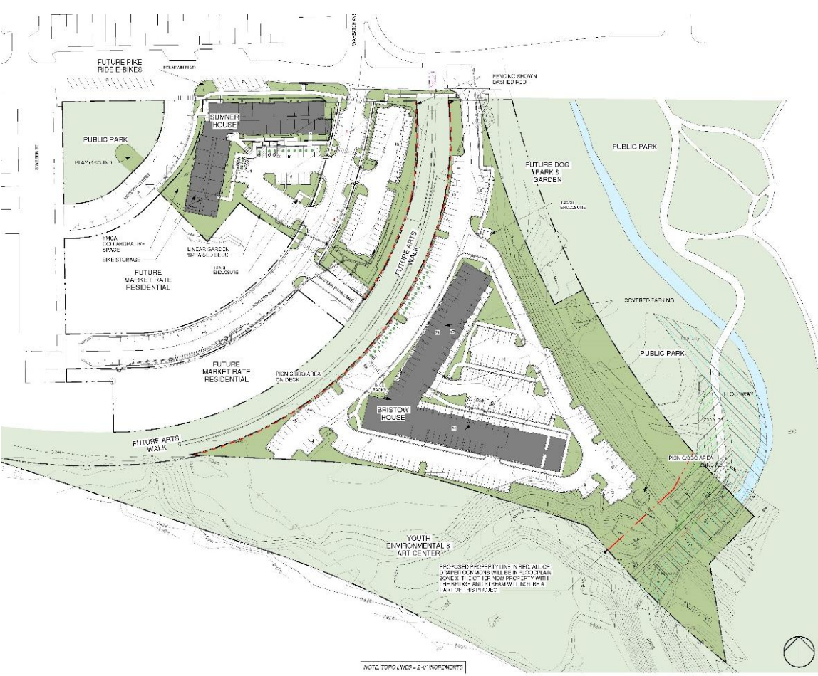
Figure 2. Draper Commons Site Plan