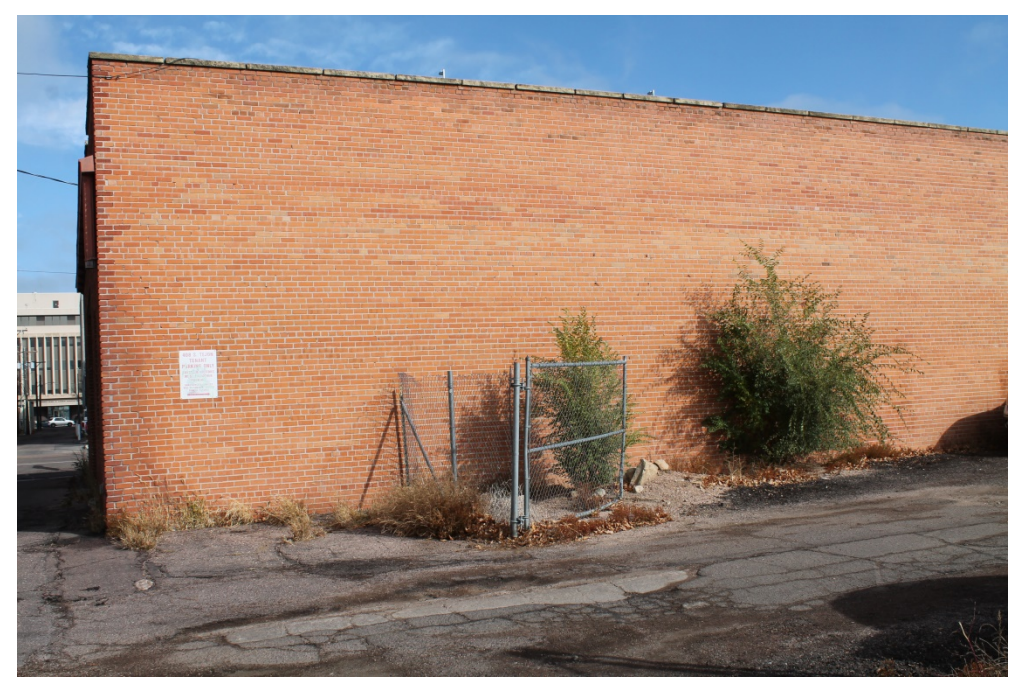
Figure 2-6 Deteriorated external walls; deteriorated exterior finishes; deteriorated gutters/downspouts; deteriorated walls/fences/gates; cracked or uneven pedestrian surfaces; presence of trash and debris; deteriorated parking lot paving; inadequate site maintenance, non-conformance to development regulations (Photo 12)

Figure 2-5 Deteriorated loading areas/ramps; cracked or uneven pedestrian surfaces; poor drainage; presence of trash and debris; potentially hazardous conditions; unsafe level changes; deteriorated parking lot pavement; lack of sidewalks or pedestrian areas; deteriorated surface drainage; inadequate site maintenance; lack of conformance to site development regulations; dry debris near structures; unsafe level changes (Photo 9)