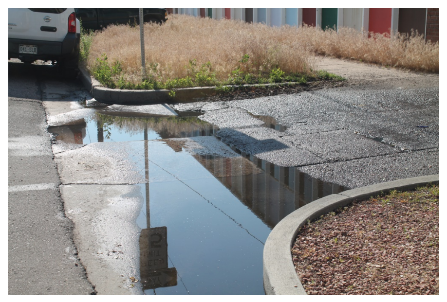
Figure 2-2 Cracked or uneven pedestrian surfaces; poor drainage; presence of trash and debris; potentially hazardous conditions; deteriorated drainage facilities; inadequate site maintenance; non-conformance to development regulations; debris near structures; fire hazards near structures; dead shrubs near high traffic areas; (Photo 2)

Figure 2-1 Deteriorated exterior walls and finishes; deteriorated windows and doors; deteriorated loading areas; presence of debris adjacent to structure; debris near high traffic areas; lnadequate site maintenance; non-conformance to development regulations; presence of debris next to structurws (Photo 1)