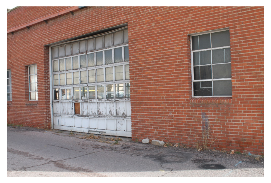
Figure 2-1 Deteriorated exterior walls and finishes; deteriorated windows and doors; deteriorated loading areas; presence of debris adjacent to structure; debris near high traffic areas; lnadequate site maintenance; non-conformance to development regulations; presence of debris next to structurws (Photo 1)