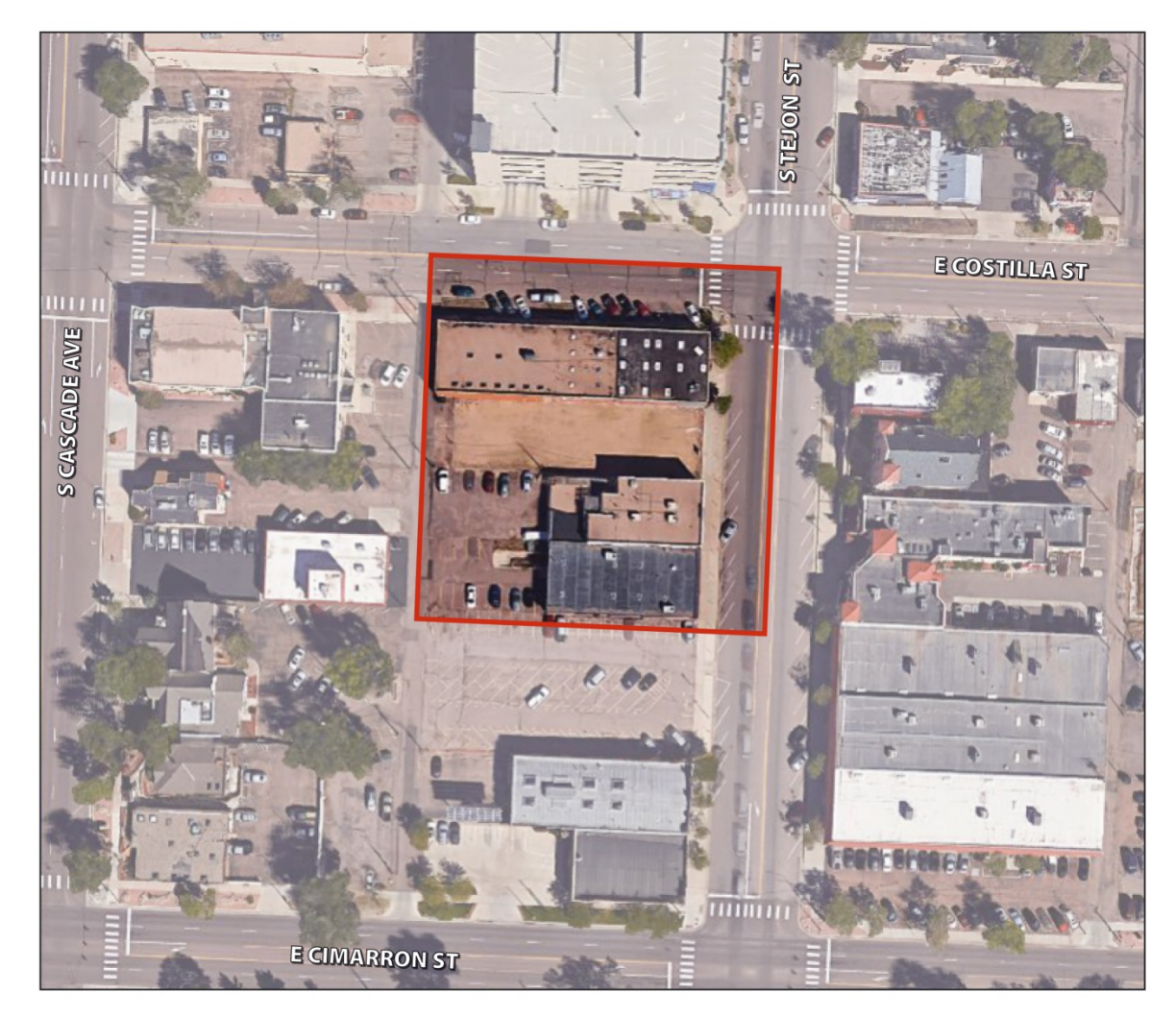
Exhibit 2-1: Study Area Boundary Map