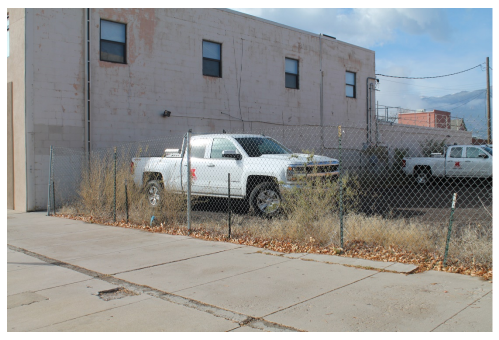
Figure 2-4 Deteriorated walls/fences; presence of trash and debris; trip/fall hazards; inadequate site maintenance; non-conformance to development regulations; deteriorated sidewalks in the right-of-way; dry debris a near structures; hazardous materials near structures (Photo 6)