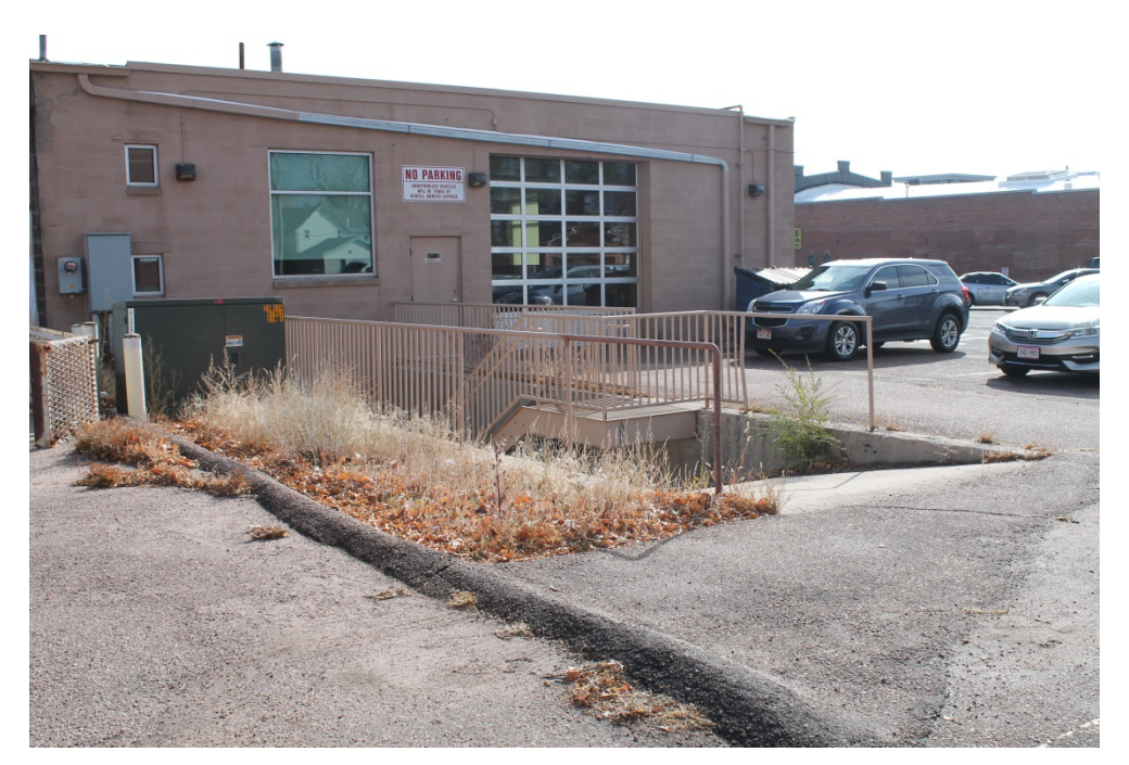
Figure 2-5 Deteriorated loading areas/ramps; cracked or uneven pedestrian surfaces; poor drainage; presence of trash and debris; potentially hazardous conditions; unsafe level changes; deteriorated parking lot pavement; lack of sidewalks or pedestrian areas; deteriorated surface drainage; inadequate site maintenance; lack of conformance to site development regulations; dry debris near structures; unsafe level changes (Photo 9)