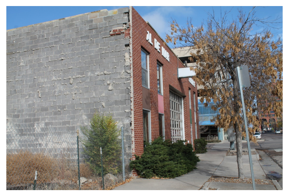
Figure 2-3 Deteriorated exterior walls; deteriorated exterior finishes; deteriorated doors and windows; cracked or uneven pedestrian surfaces; presence of trash and debris; potentially hazardous materials and conditions; deterioration of signage; trees and shrubs in high traffic areas (Photo 5)