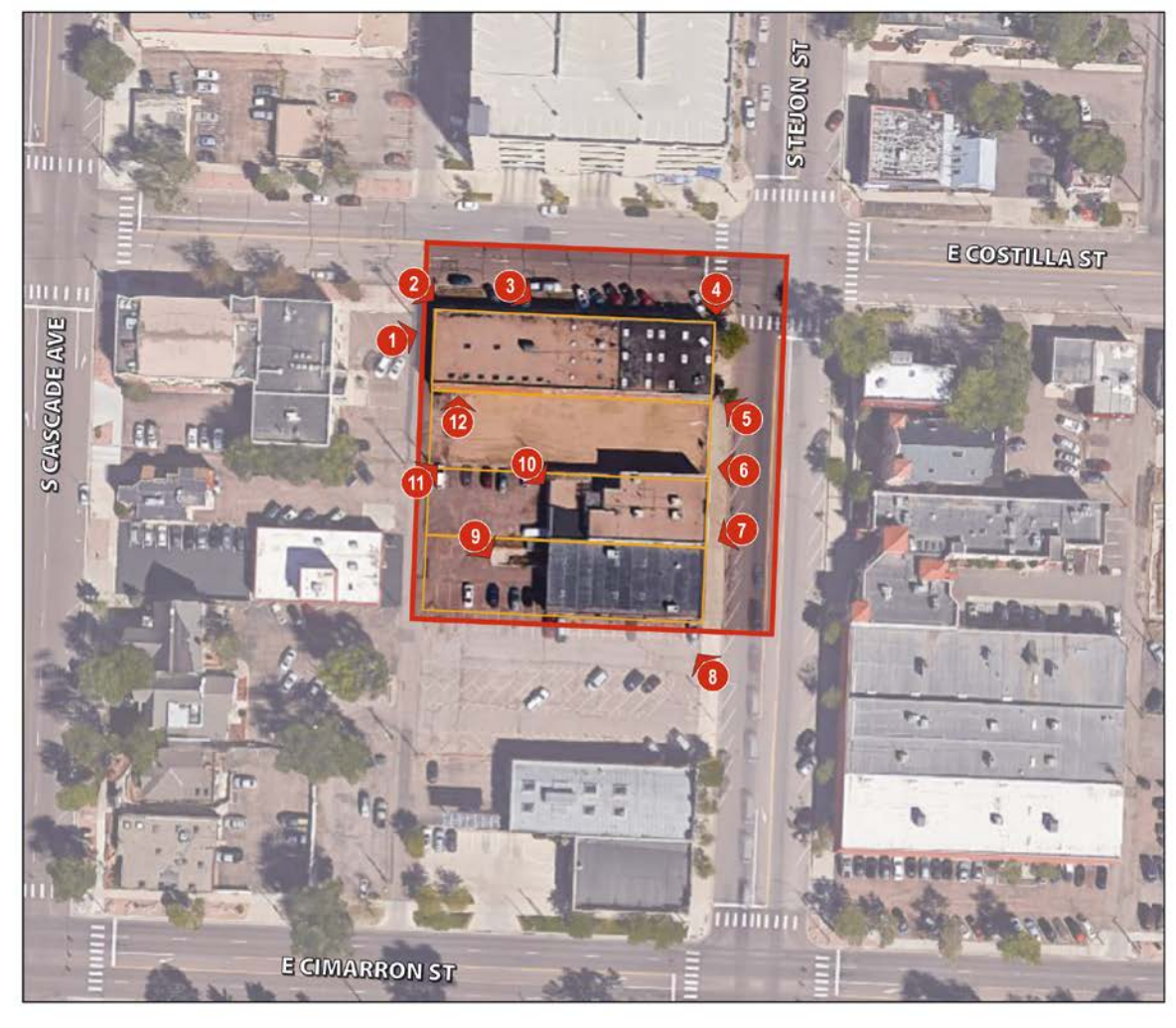
Exhibit 3-1: Field Survey Photo-Reference Map