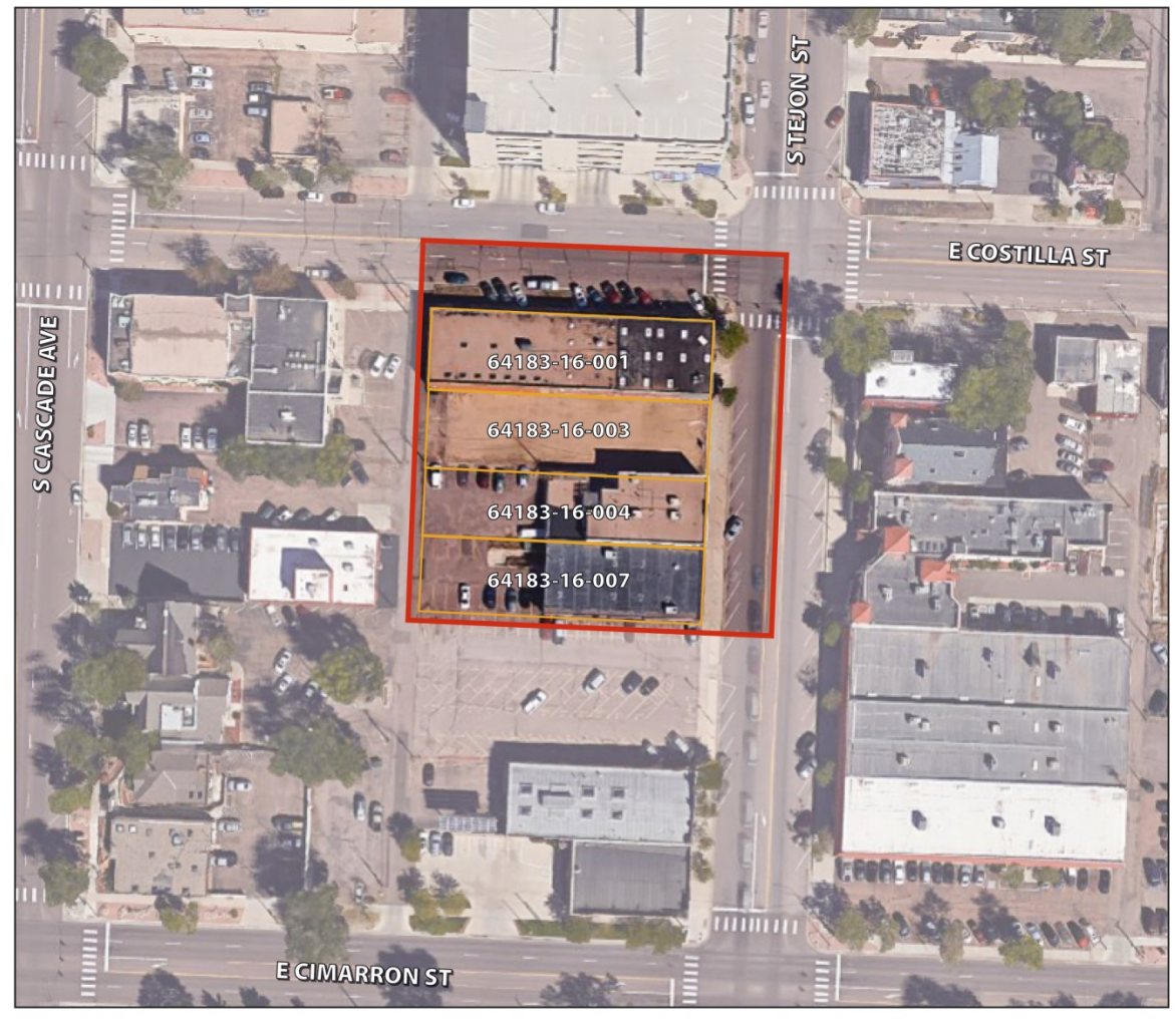
Exhibit 2-3: Study Area Parcel Map