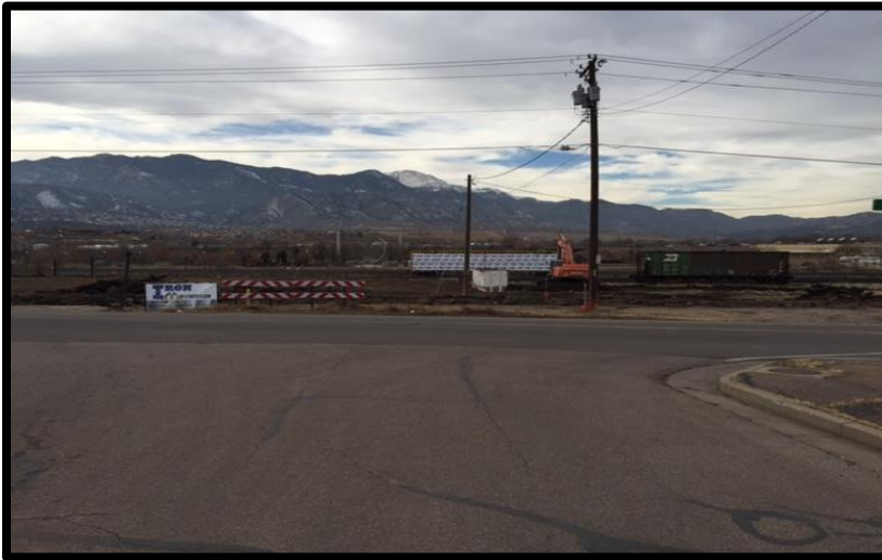
US Olympic Museum Site