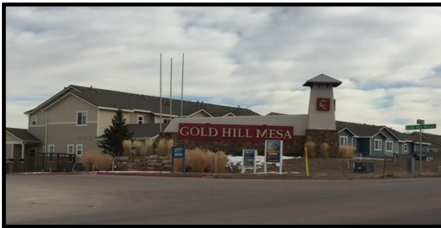
Twenty-first Street Entrance

The Area includes the site of a former gold processing facility known as the Golden Cycle Mill. The mill operated from 1906 to 1949 processed approximately fifteen million tons of ore from Cripple Creek and Victor area gold mines.