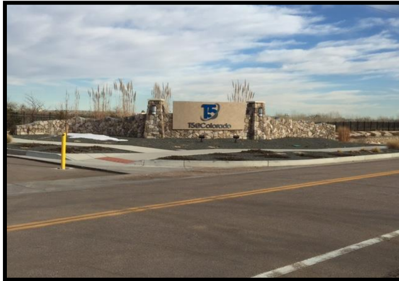
West Side Entrance

Location: The boundaries of the Area include approximately 109 acres of land generally defined to include 4 legal parcels plus public rights-of-way. Geographically, it is situated in southern Colorado