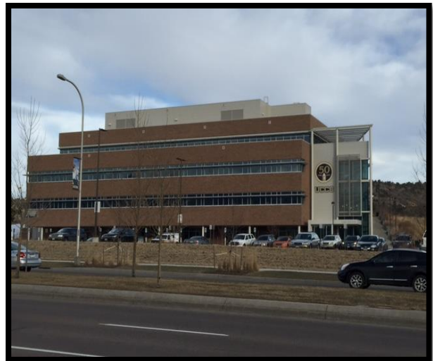
The Lane Center

The Winslow BMW Dealership opened along the east side of N. Nevada Ave to the north of UCCS. Construction is under way for the Colorado General Hospital, a 52 bed hospital which will be located near I-25 along the west side of N. Nevada Ave.