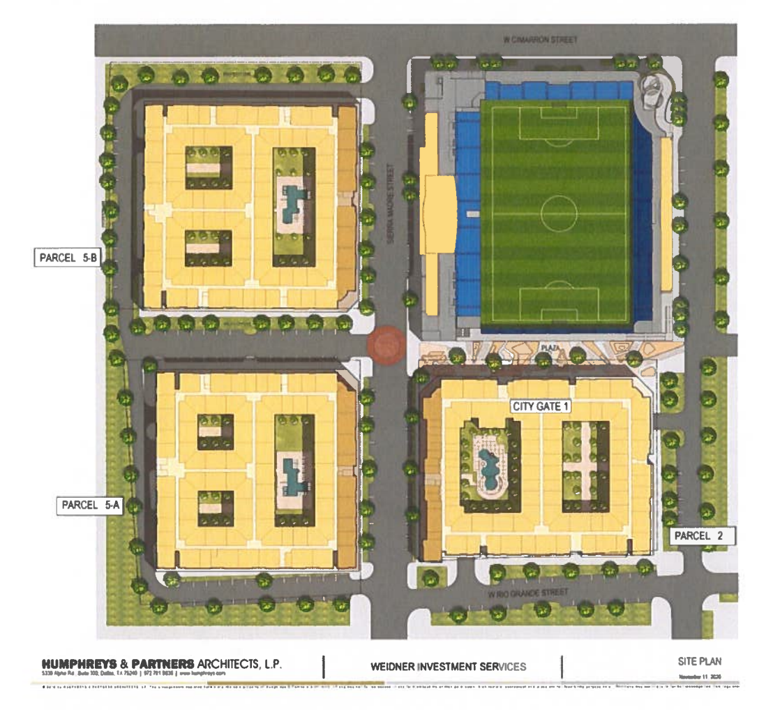
Figure 3. City Gate Phase 1 Rendering