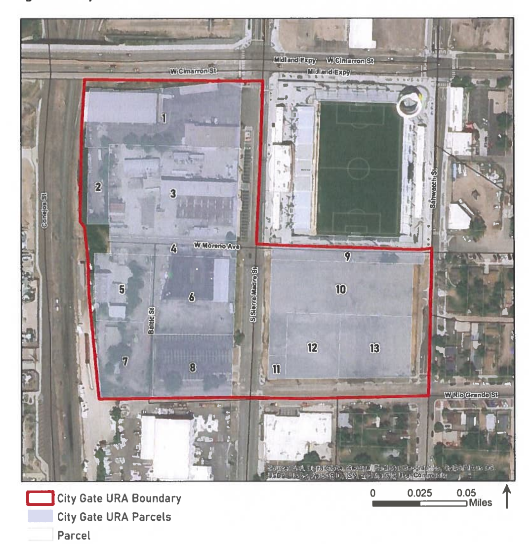
Figure 1. City Gate Urban Renewal Plan Area